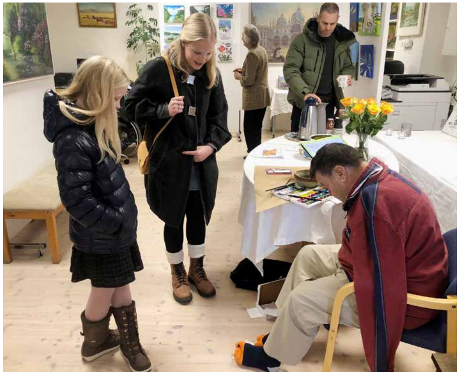
"Open-house exhibition" of the Norway publishing house.