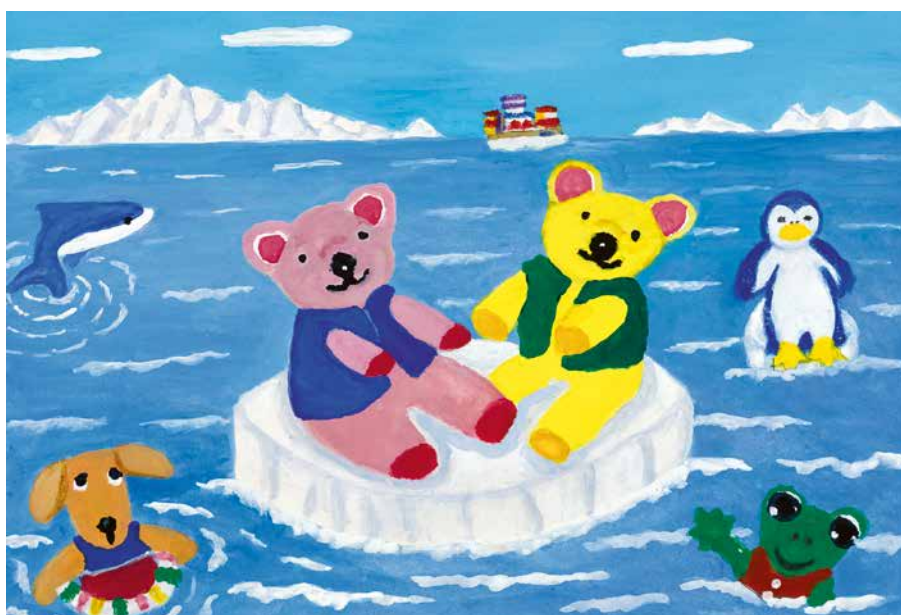
"On the ice", watercolours, 21×27 cm.

I was only able to think more flexibly and freely and be more self-confident when I saw how skilfully and calmly an older colleague ate from his plate with his mouth at dinner. Over time, after I had often experienced how the