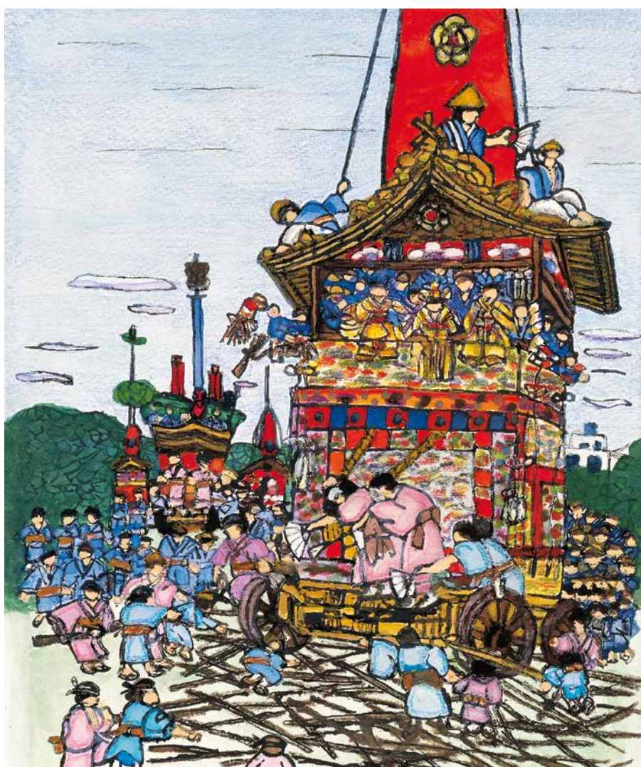
"Gion Festival", watercolours, 36×26 cm.