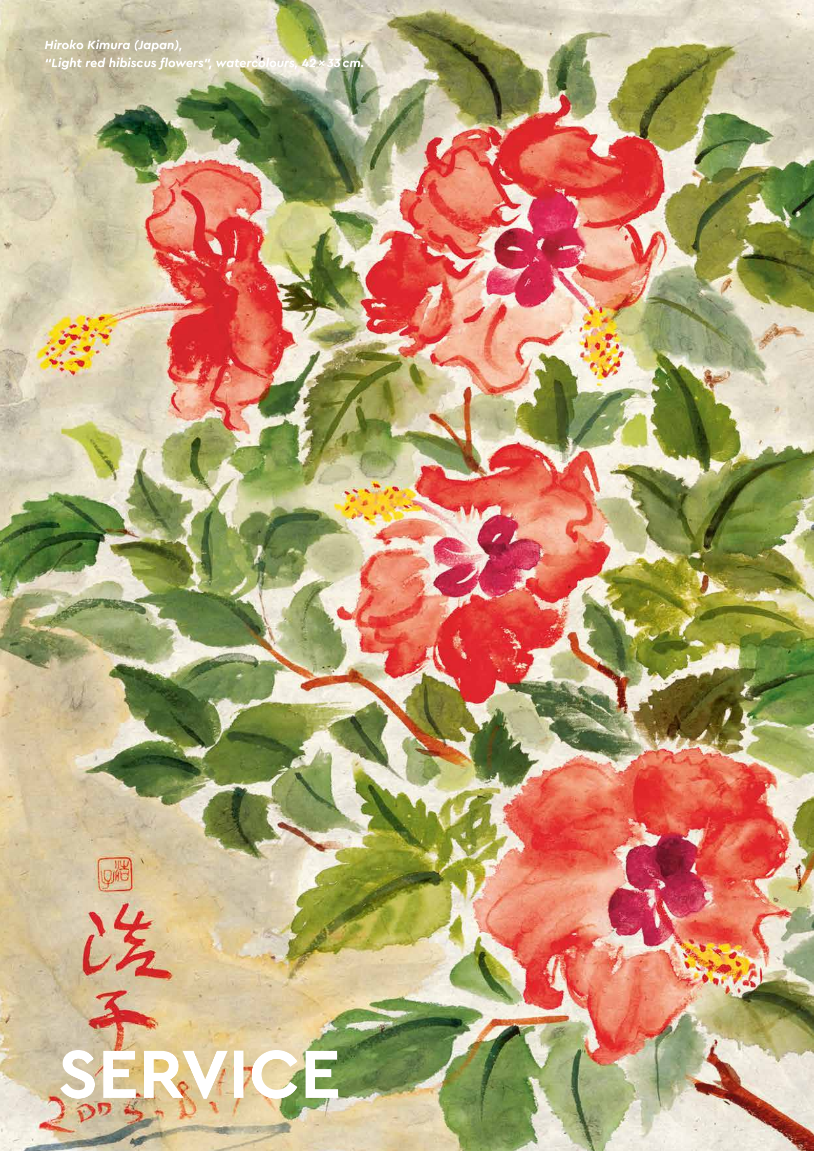
Hiroko Kimura (Japan), "Light red hibiscus flowers", watercolours, 42×33 cm.