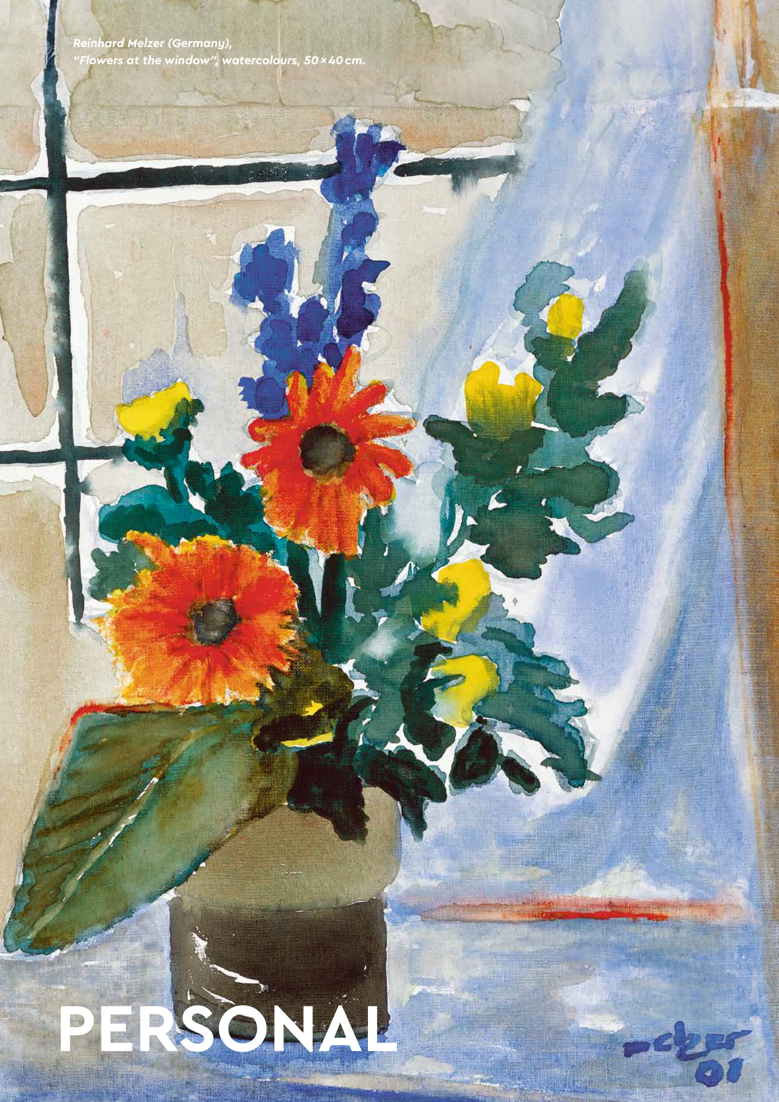
Reinhard Melzer (Germany), "Flowers at the window", watercolours, 50 × 40 cm.