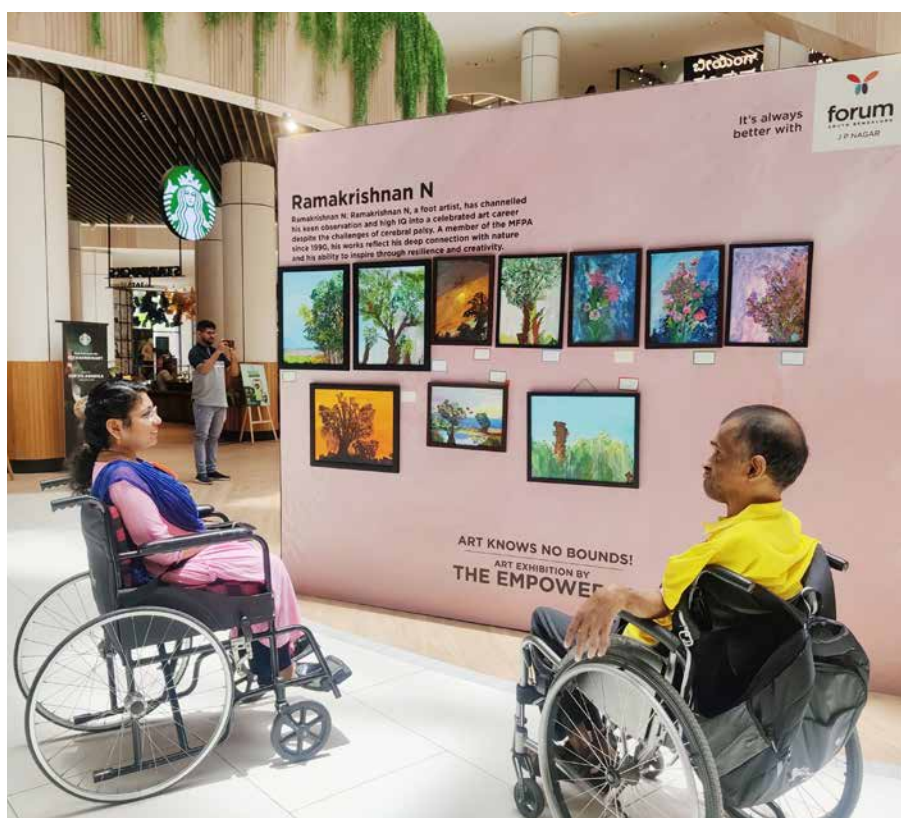
The two Indian artists at the participated.