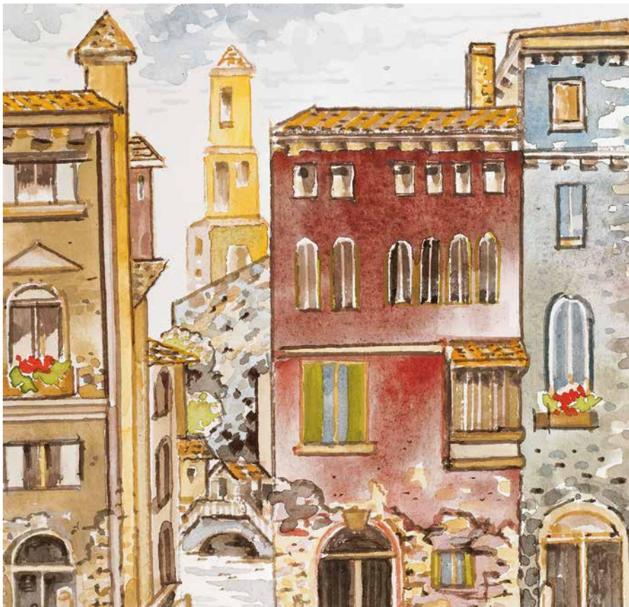
"Venice 1", watercolours, 22 x 16 cm.