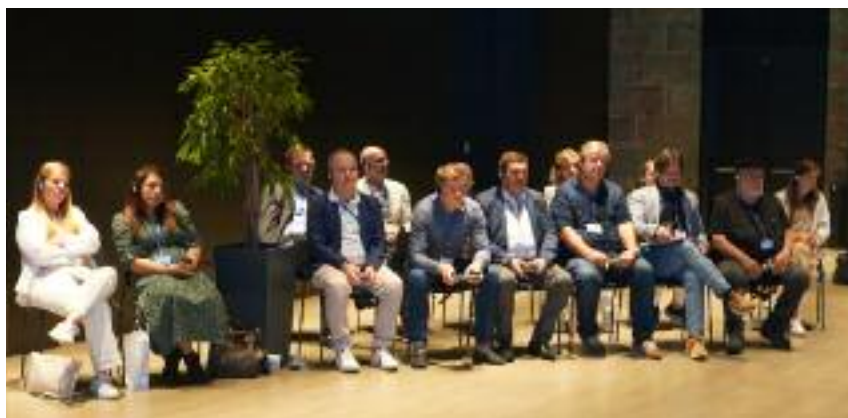
Guests at the Delegates' Convention included publishers and publishing staff, who also attended at the 3rd day of the conference.