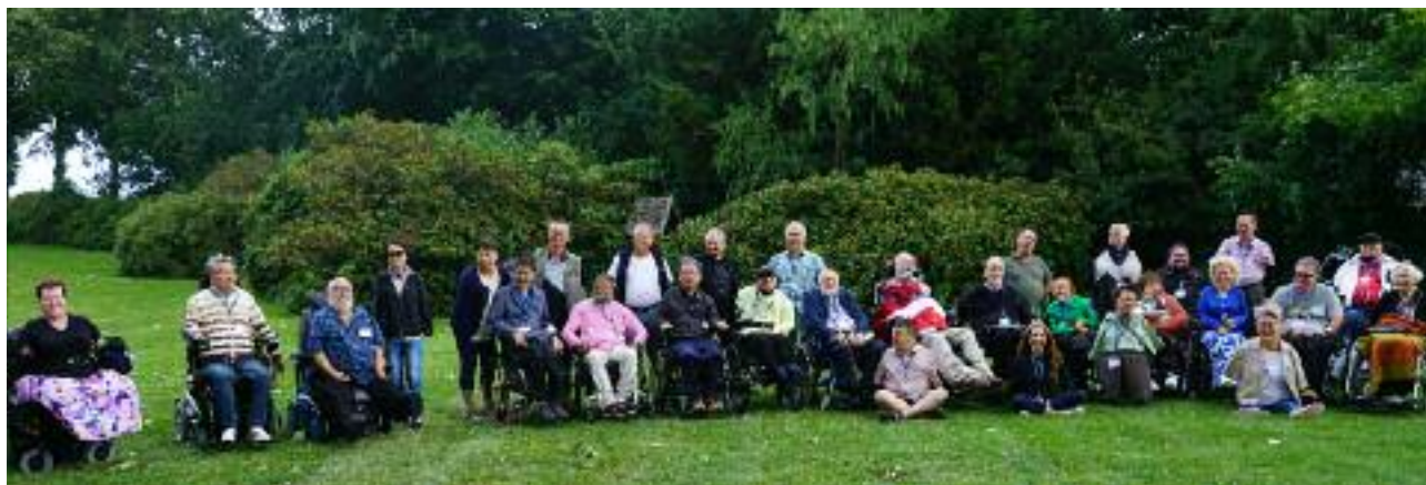
The group picture of the participating artists at the 2023 Delegates' Convention in Copenhagen.