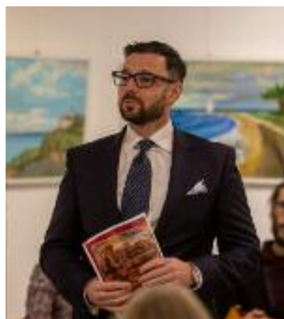
The exhibition of the Slovenian publishing house was opened by the Hungarian Ambassador in Ljubljana, His Excellency Andor Ferenc Gábor.