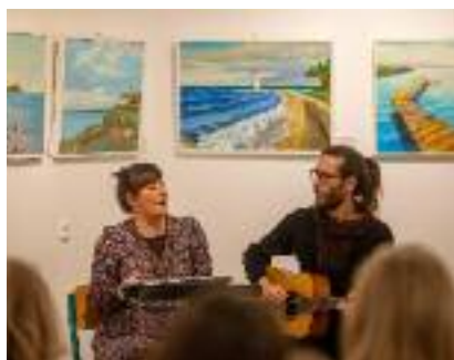
The vernissage was also accompanied by music.

The workshop was attended by about 125 students from the local commercial school. The exhibition was opened by the Hungarian Ambassador in Ljubljana, His Excellency Andor Ferenc Gábor. As a symbol of gratitude, the publishing house presented the Liszt Institute with a painting by the painter Nevenka Gorjanc. The Liszt Institute opened its doors to local mouth and foot painters for the second time. Due to the gallery's location in the centre of Ljubljana in a very busy area, the exhibition was able to attract many visitors.