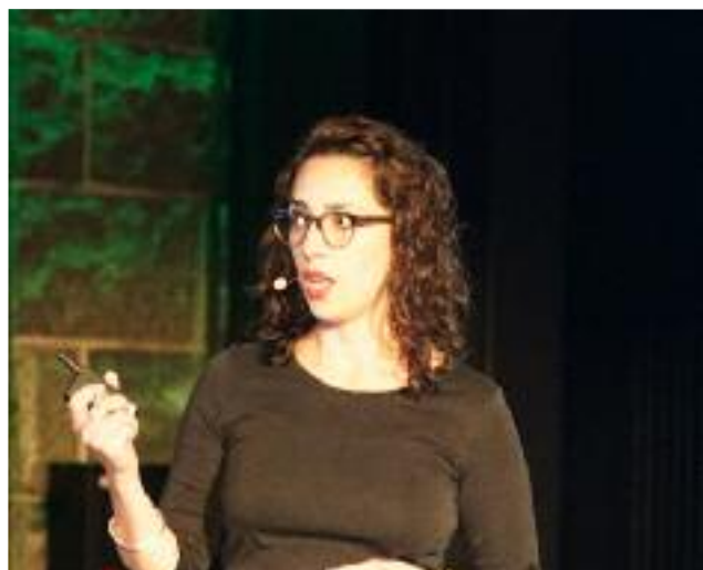
As part of the entertainment evening, there was also a talk on the topic that the Danes are among the happiest people on earth.