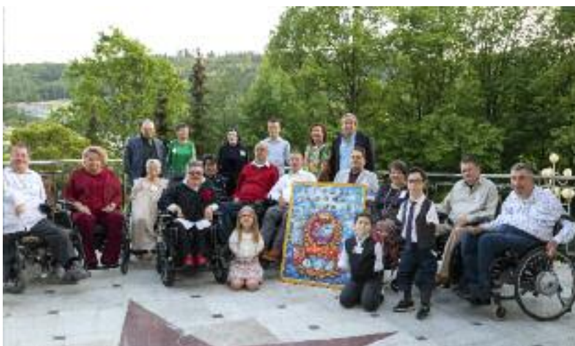
The mouth and foot painters from Poland taking part in the publisher's 30th anniversary workshop and festivities.