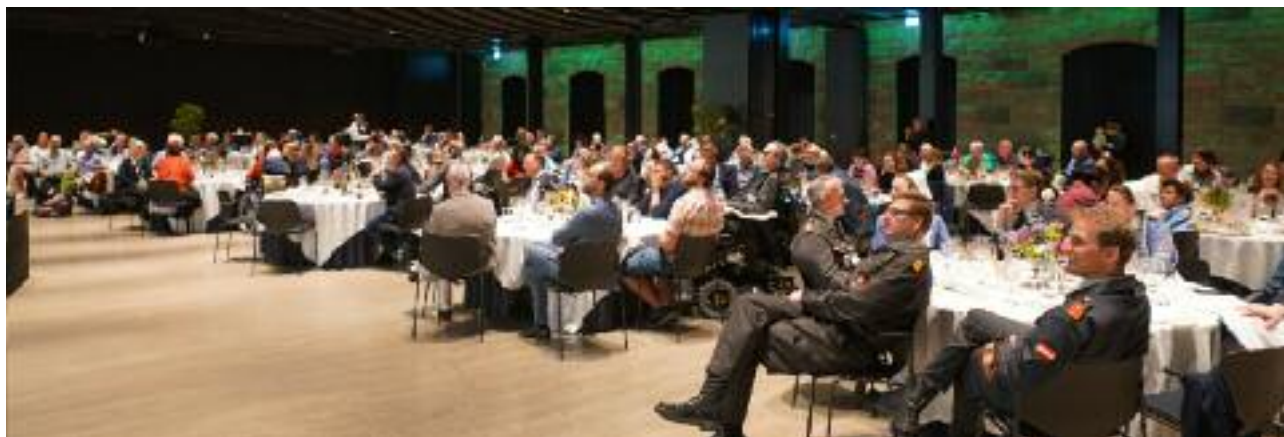
The evening of entertainment was a festive occasion in a special atmosphere.