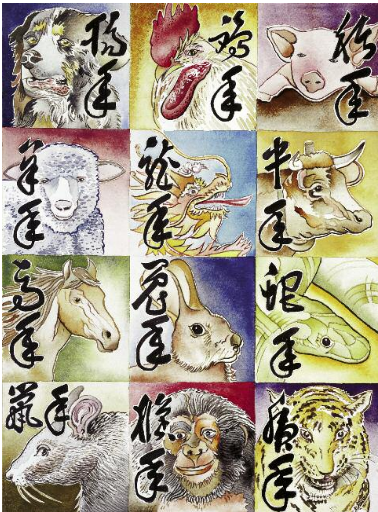
Brom Wikstrom (Full Member/USA), "Animal Heads - Chinese Zodiac", watercolour, 40x30 cm.