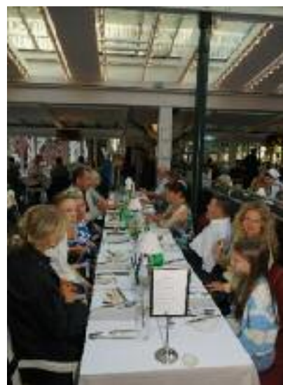
The evening had a relaxed atmosphere.