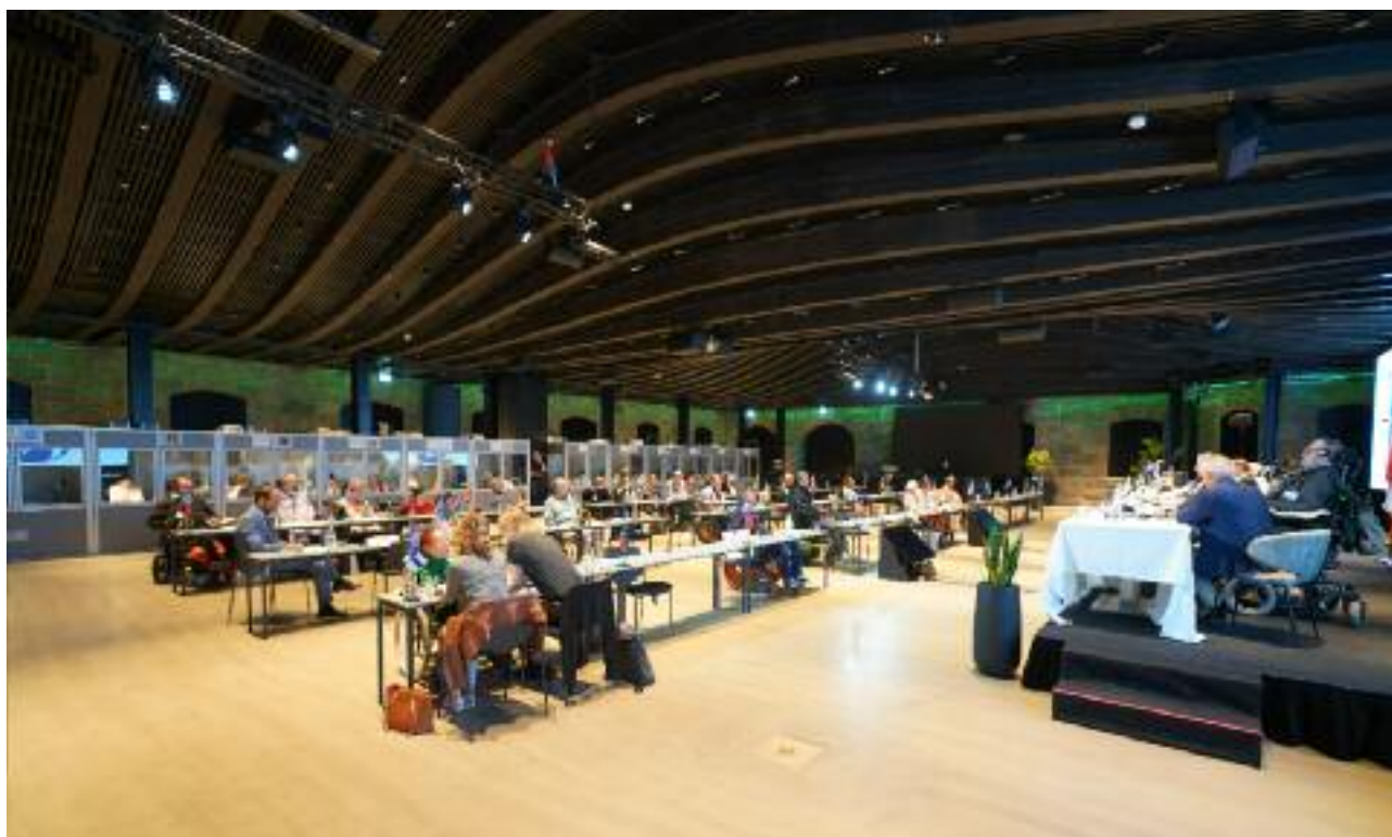
Delegates met for the conference on three mornings. At these meetings, parts of the Board were elected. The delegates voted not to make any changes to the Board.