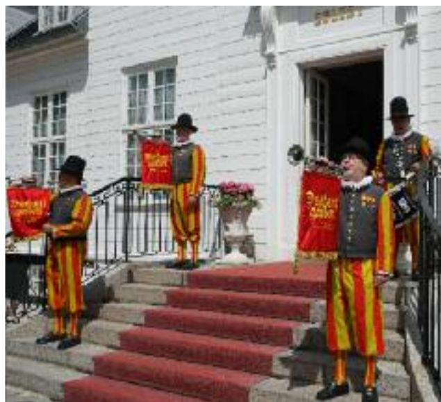
The artists were received with musical honours at the Royal Shooting Club.