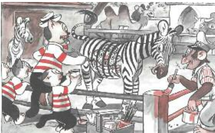
"Behind bars" is the title of this caricature.