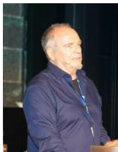
Information about the VDMFK's film and social media project was also discussed at the evening of entertainment.