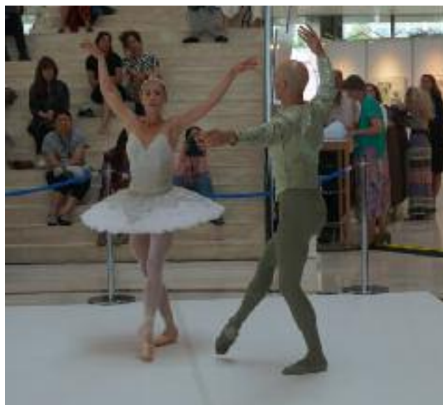
A ballet performance was held as part of the exhibition opening.