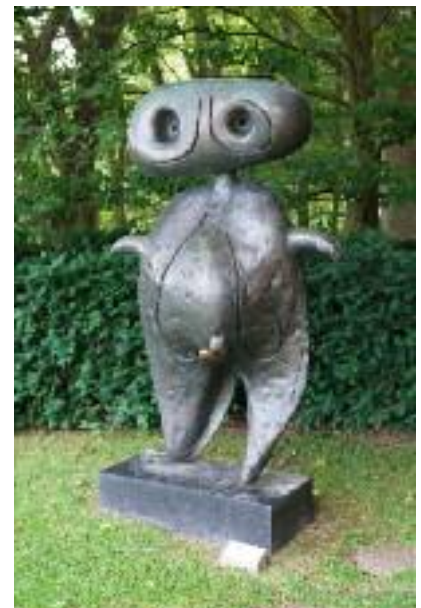
The Louisiana Museum is known for sculptures including those by Alberto Giacometti (left) or Joan Miró (right).