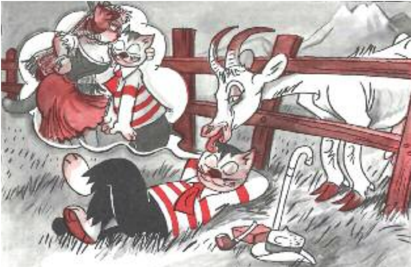
The caricature "Dream and Reality".

page we show three of these caricatures.