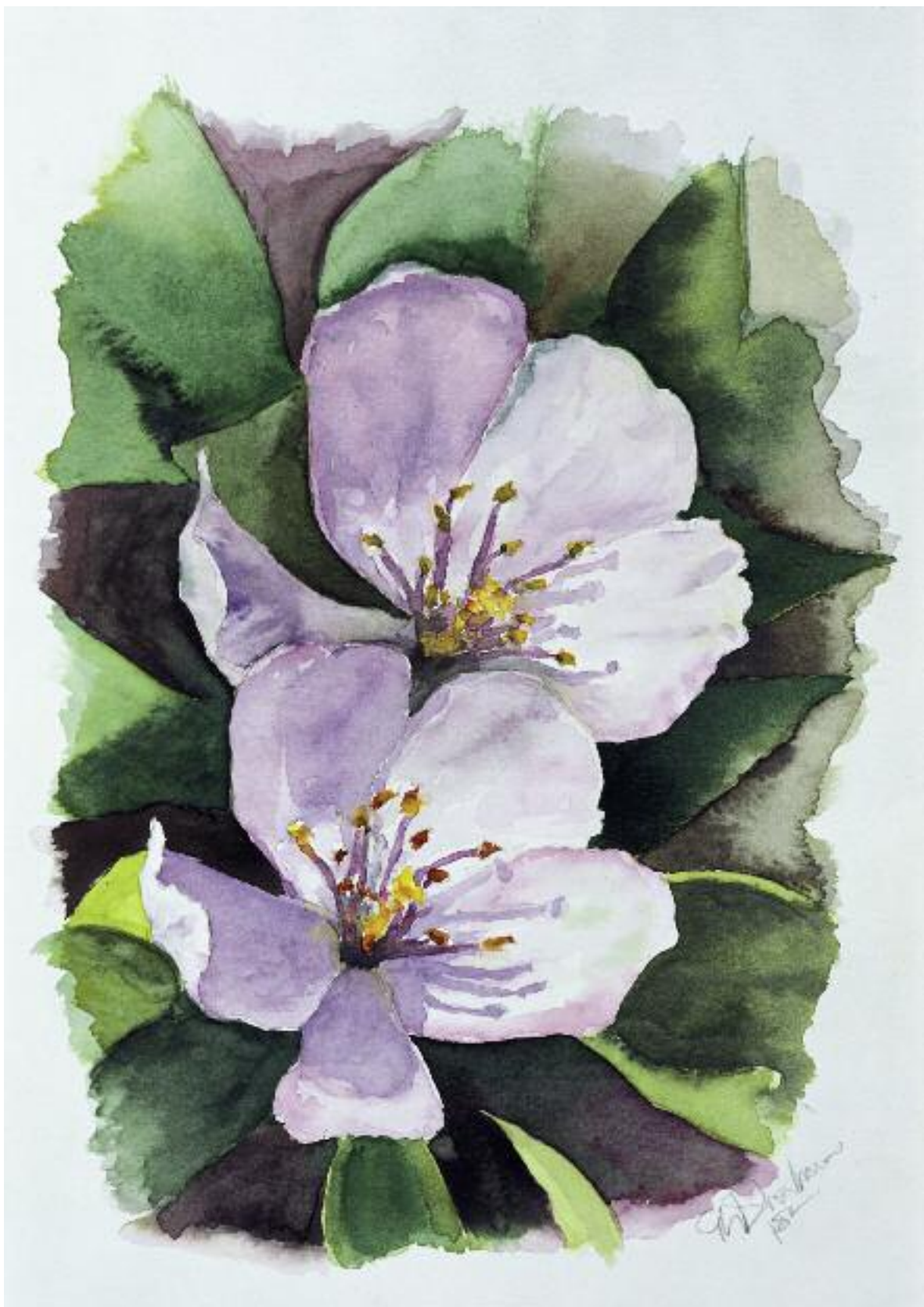
Grant William Sharman (Full Member/New Zealand), "Two white/purple flowers", watercolour, 30x21 cm.