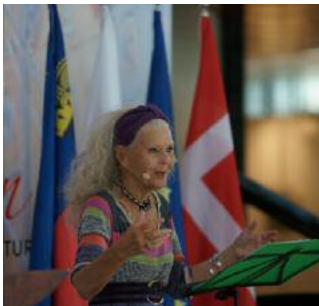
The actress Lone Hertz during her speech to mark the opening of the exhibition.