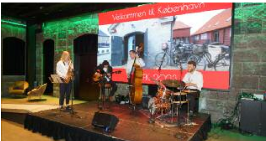
The opening evening was accompanied by music from a local band, which set the mood.