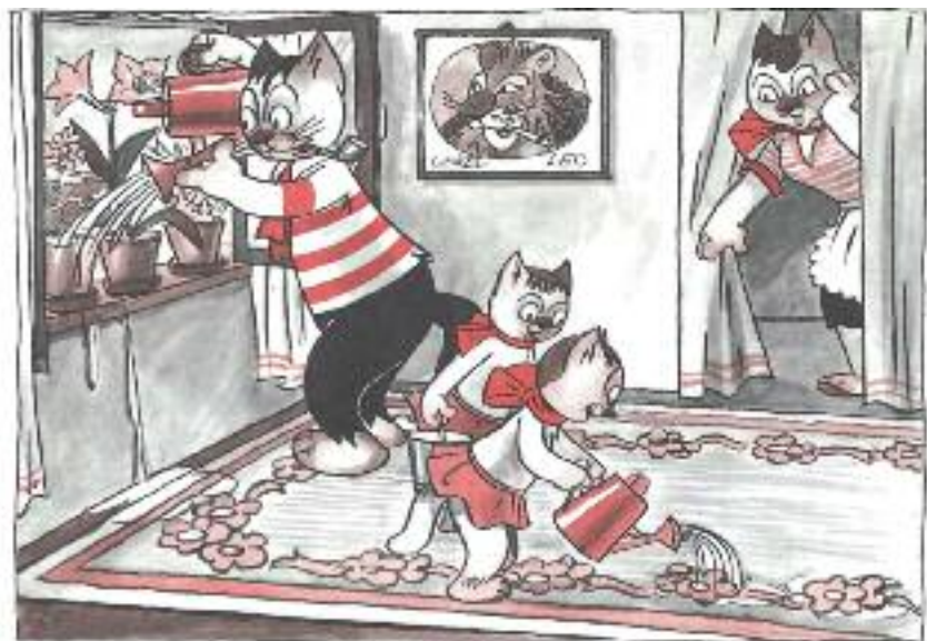
This caricature is called "Watering Flowers".