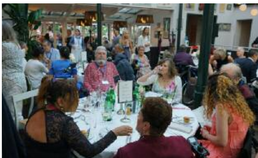
The mood among the American and Canadian delegations was also very joyful and amicable.