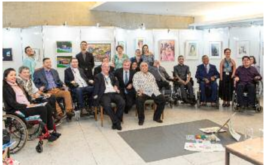
The atmosphere among the mouth and foot painters and their carers during the opening of the exhibition was buzzing.

ented across all five continents and works in the interests of some eight hundred artists worldwide. I would like to take this opportunity to publicly thank the Brazilian artists and congratulate them on their enthusiasm for supporting our Association. Well done, everyone! Finally, I hope that by visiting this exhibition you will be able to get to know our Association more closely and that all the artists who belong to it will appear to you as a picture of their work, with a view that is directed towards a life filled with colour and optimism."