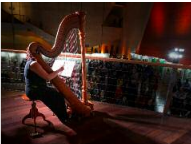
The opening of the exhibition was accompanied by the sounds of a harp.