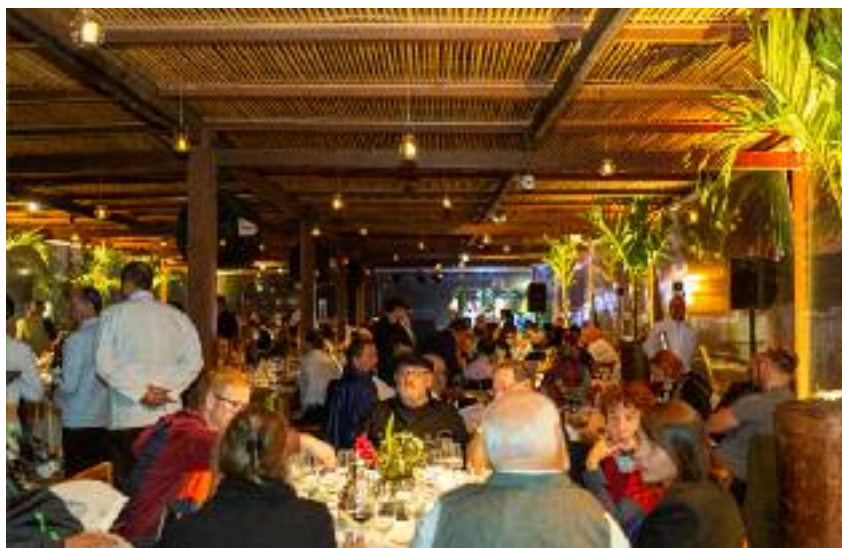
Artists and their carers enjoying the mood and atmosphere of the closing evening.