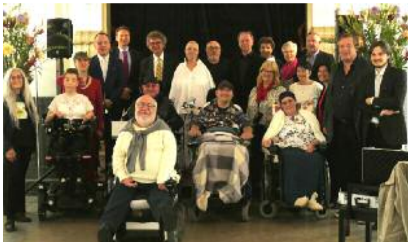
Participants attending the special exhibition marking the 60th anniversary of the Swiss publishing house.