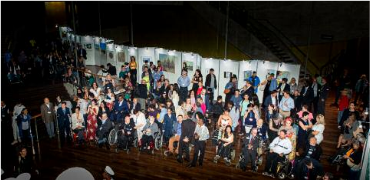
The opening of the exhibition was well attended. Numerous guests were present in Rio de Janeiro in addition to the mouth and foot painters as well as their carers.