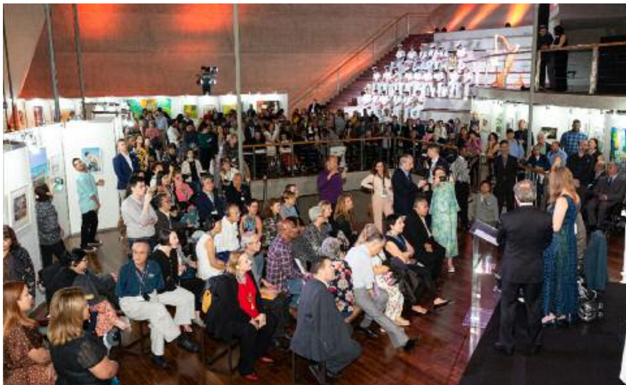
Mouth and foot painters from all over the world as well as many guests attended the opening of the exhibition held at the Cidade das Artes centre.

One of the highlights of the week in Rio de Janeiro was the opening of the exhibition. Over one hundred works by mouth and foot painters from all over the world were on display at the Cidade das Artes centre.