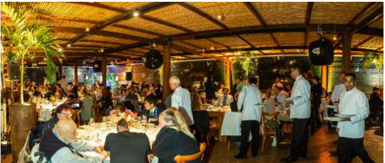
The final evening had a Brazilian feel to it.