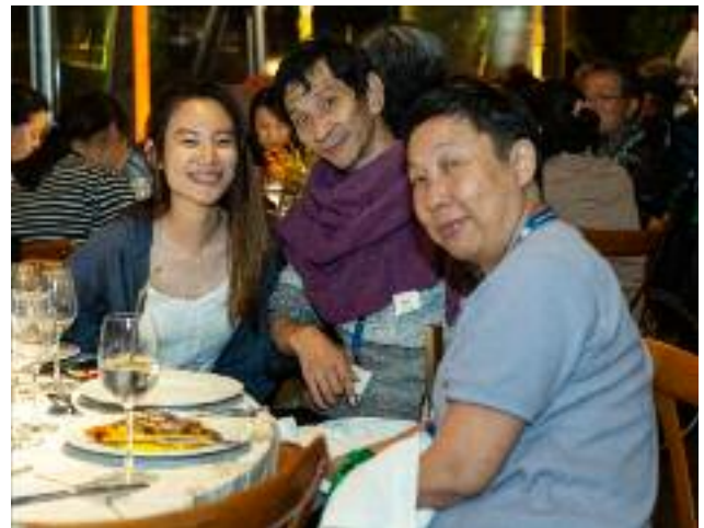
Asian delegates also enjoying the mood at the end-of-week dinner.