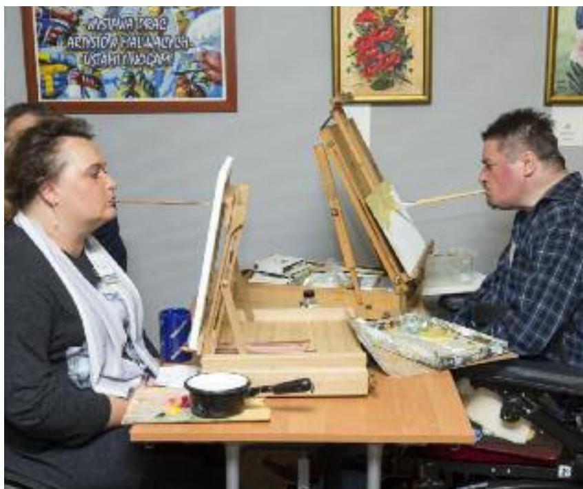
The artists of Poland giving a painting demonstration at the opening of the exhibition.