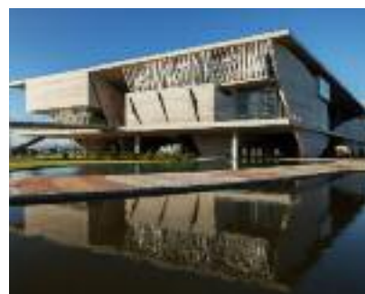
The Cidade das Artes centre displayed over one hundred paintings by hand and foot painters from all five continents for the general public.