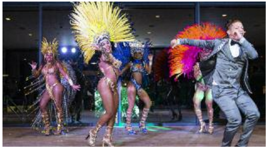
The opening evening would not have been complete without a Brazilian samba performance.