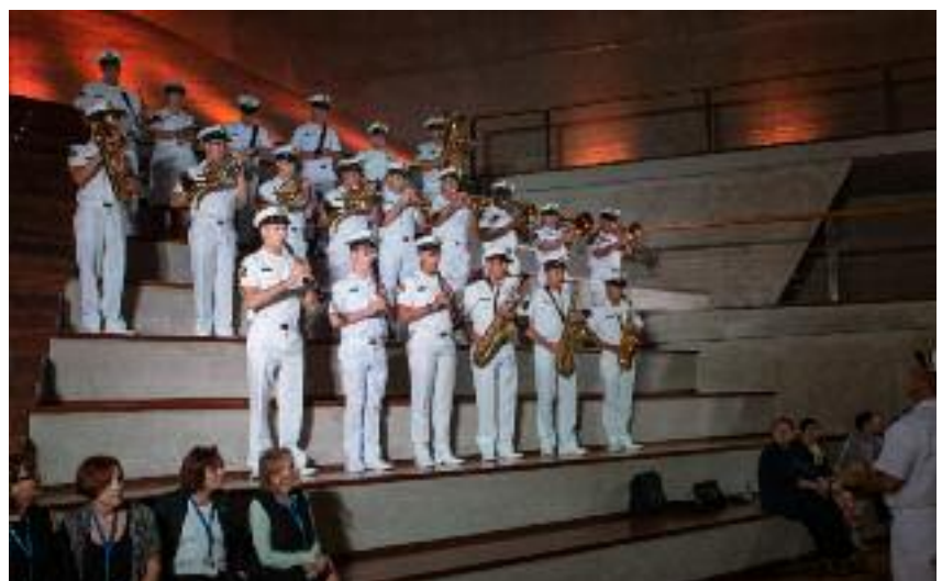
The opening of the exhibition was formally accompanied by sounds from the Brazilian Marine Corps.