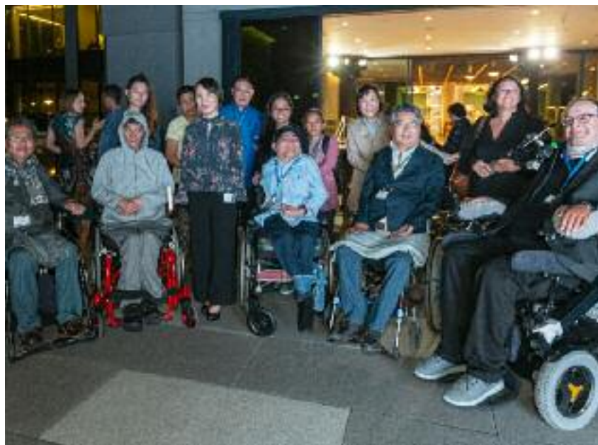
For many artists from across the world, a Delegates' Convention also offers a superb opportunity to meet with long-standing friends.