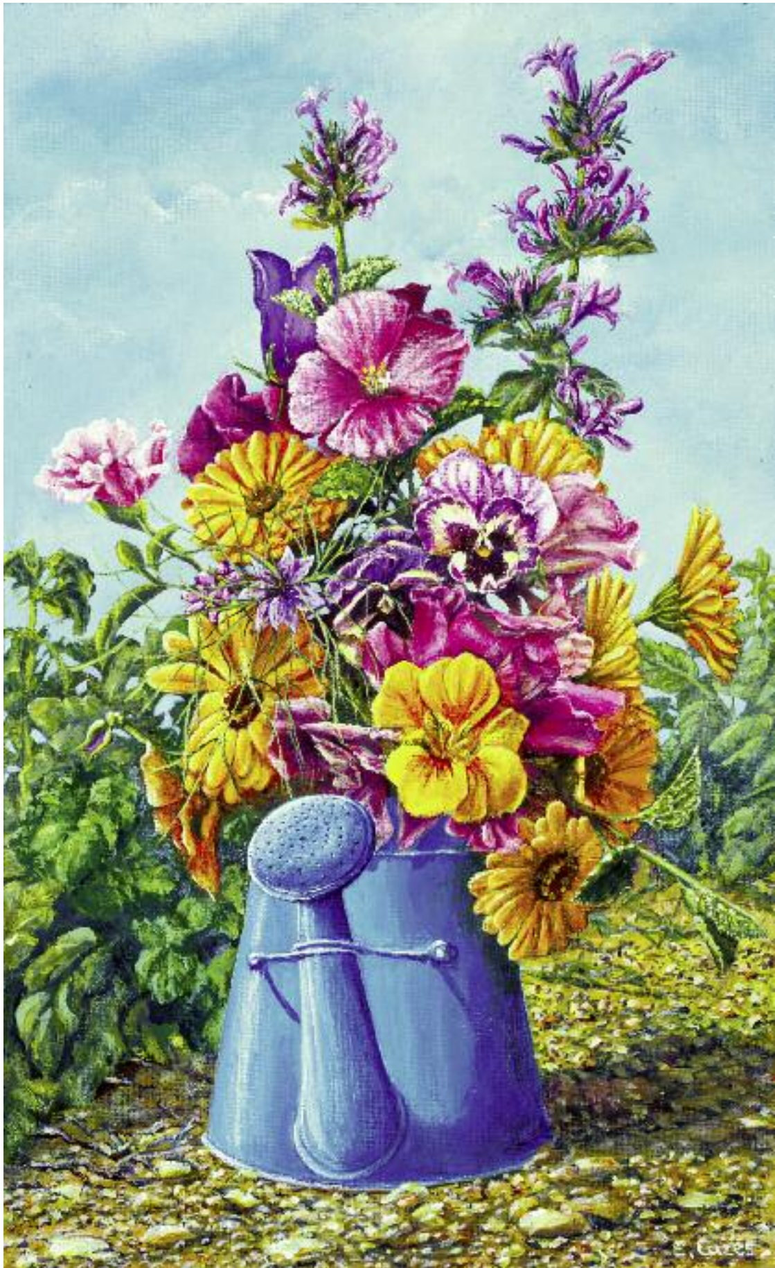
Elodie Cazes (Full Member/France), 'Colourful bouquet in blue watering can', acrylic, 39x24 cm.