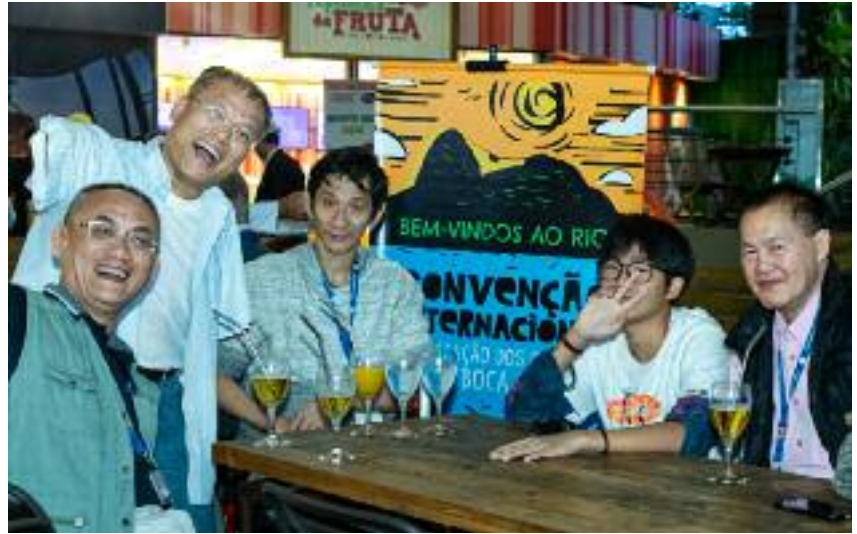
The mouth and foot painters as well as their carers were resolutely undismayed by the damp weather.